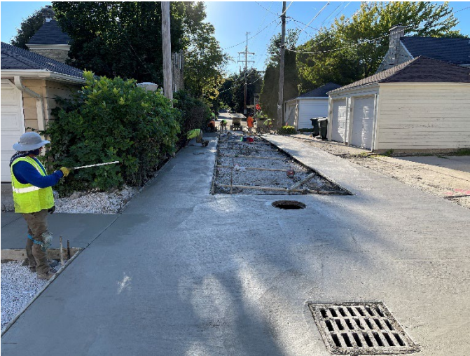
Alley 3 Concrete