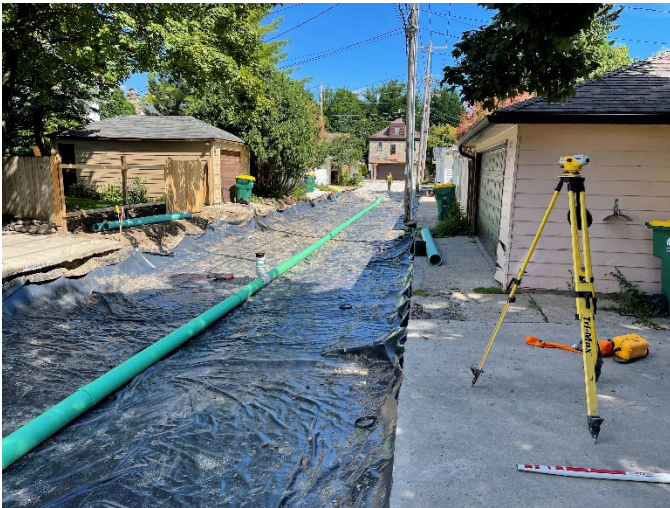
Alley 3 Storm Sewer